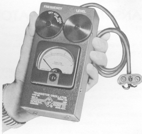
Figure 1. Panel View of Type 1307-A Transistor Oscillator.